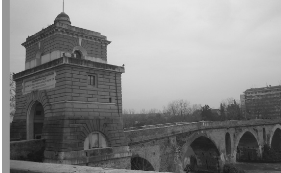
Fig. 2 – Rome.Milvio Bridge. The arches and Valadier’s Tower (East side).

of his restoration of the Via Flaminia, but this may have stood over the central pier. The first span and south abutment have been extensively reconstructed, and the original northern abutment is now buried (P. Gazzola shows a seventh span in the northern approach). There are also floodways in the four more southerly piers. They differ considerably in geometry: the first two are small in height and set low; the next has its crest high up, close under the roadway, but the bottom of the opening is also high; the fourth again has a high crest, but its base is somewhat lower, providing the tallest opening of the four. There is no flood opening between the last two spans from southern end. The first span, which is of brick, is entirely new; the second and third spans have travertine facing for the complete arches, but in two different styles.