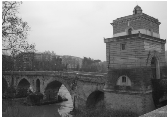
Fig. 3 – Rome.Milvio Bridge. The arches and Valadier’s Tower (West side).

The lower courses have alternate stretchers and headers; that is, each alternate voussoir is composed of two stones. The upper voussoirs are each formed of a single stone, with the outer face left rough. Travertine is used only for the facing and the first course of the vault; the remainder is Gabine stone. The fourth span has three styles of construction; the lower courses show the two stages of travertine facing found in the second and third spans; the upper courses are of brick. Fifth span, apart from seven courses at its southern end, which are of the second period of second and fourth spans entirely of brick, as is sixth span. The earliest work is from 109 BC; the second travertine stage may belong to the first century AD.; and the brickwork of fourth and fifth spans is from the time of Nicholas V.