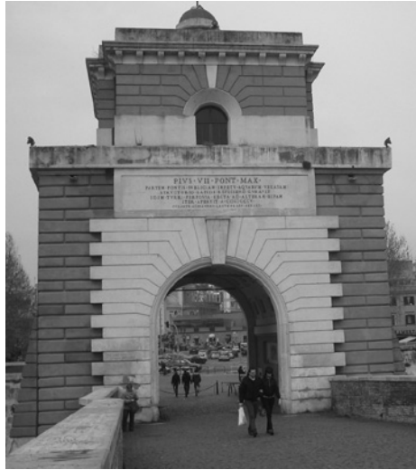
Fig. 4 - Rome. Milvio Bridge. The Valadier's Tower, North-West side.