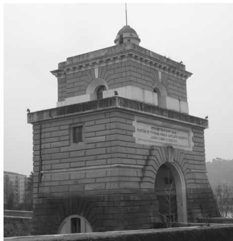
Fig. 5 - Rome. Milvio Bridge. The Valadier's Tower, South side.

The roadway was originally horizontal between the centres of second and fifth spans, and then sloped down to each bank. This has since been modified at the southern end, where the roadway is now horizontal. The upper arch in first span presumably also forms part of this modification. The tower on the north abutment carries an inscription from 1849. There was an arch erected on the bridge in 27 BC. to honour Augustus at the time of his restoration of the Via Flaminia, but this may have stood over the central pier.